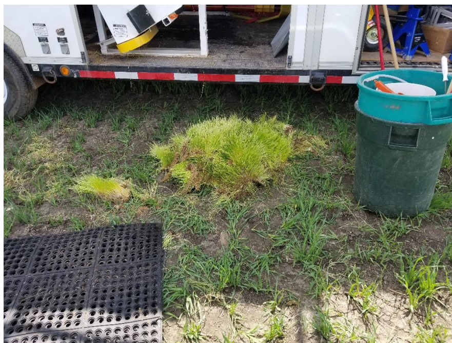
Figure 2: Sample Housekeeping Issues (sprouted grain)