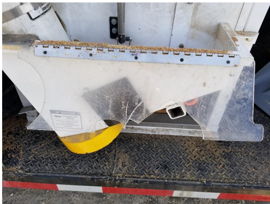
Figure 1: Sample Damage