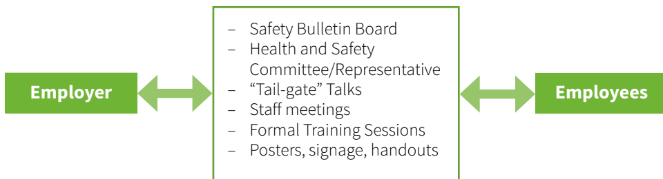
Figure 2. Methods of communication at the workplace

There are certain requirements to post information , which can be seen in the list below. It is also important to be aware of the information that is required to be available for viewing (e.g. Workplace Health and Safety Regulations).