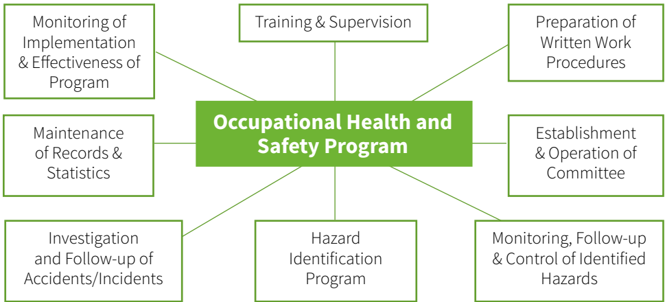
Figure 3. Components of an Occupational Health and Safety Program

The program shall be developed in consultation with the committee and reviewed with all employees.