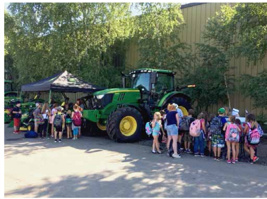
Spending our day at Hants County Exhibition participating in Future Farmers Friday where grade 3-5 students learn about farming!