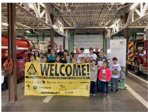
Had a great time at the Yarmouth Progressive Ag Safety Day!! Thanks to all our participants and volunteers!!