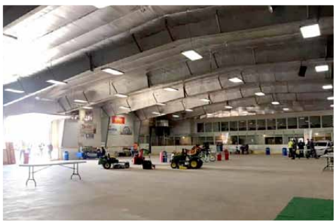
At Progressive Agriculture Safety Day in Oxford! Promoting Farm Safety to grade 4 students across Cumberland County!