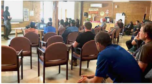
Attended the Scotian Gold Apples grower meeting this morning and hosted a road safety info session along with vehicle compliance. Great turn out, great discussion!