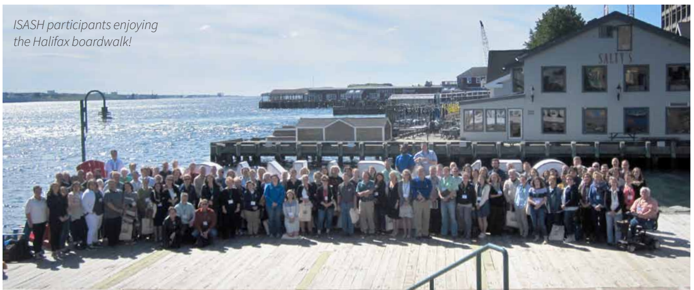
ISASH participants enjoying the Halifax boardwalk!

CANADIAN AGRICULTURAL SAFETY ASSOCIATION ASSOCIATION CANADIENNE DE SÉCURITÉ AGRICOLE